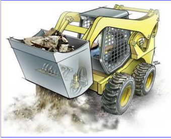
Crusher bucket mobile

Have a look at some well- proven applications: