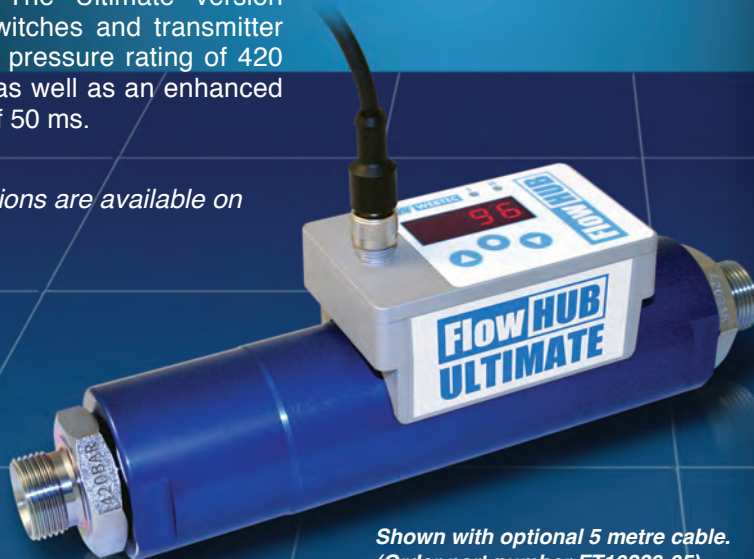
Shown with optional 5 metre cable. (Order part number FT10228-05)

Other configurations are available on request.